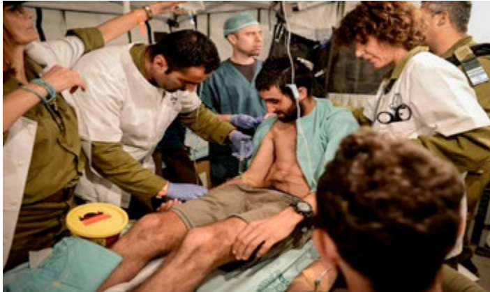
Hundreds of casualties were tended at the IDF field hospital in Kathmandu, Nepal, after the earthquake earlier this year.

A mind-boggling 57.5 million people in 22 countries will receive humanitarian aid in 2015, according to a UN report . And that number does not include anyone displaced by a natural disaster.