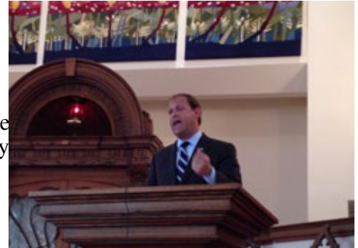
Kentucky Congressman Andy Barr.

While Keeping Your Sanity.” Later this year JFS will sponsor a program about setting up advance directives and wills. In working with retirees, we have developed a new program called Arts and Adventures geared at providing our community members who are no longer working with meaningful cultural activities. In the coming year we will continue to offer adult education program including our monthly Lunch and Learn with the Rabbis, Global Day of Jewish Learning and, One Book- Lexington. As we look toward 5776, we welcome you to join us as we care for one another, learn together, rejoice, and celebrate a New Year.