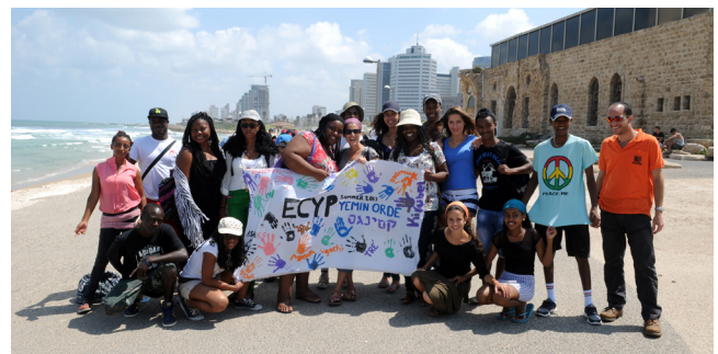
ECYP fellows and Israel teens in Tel Aviv